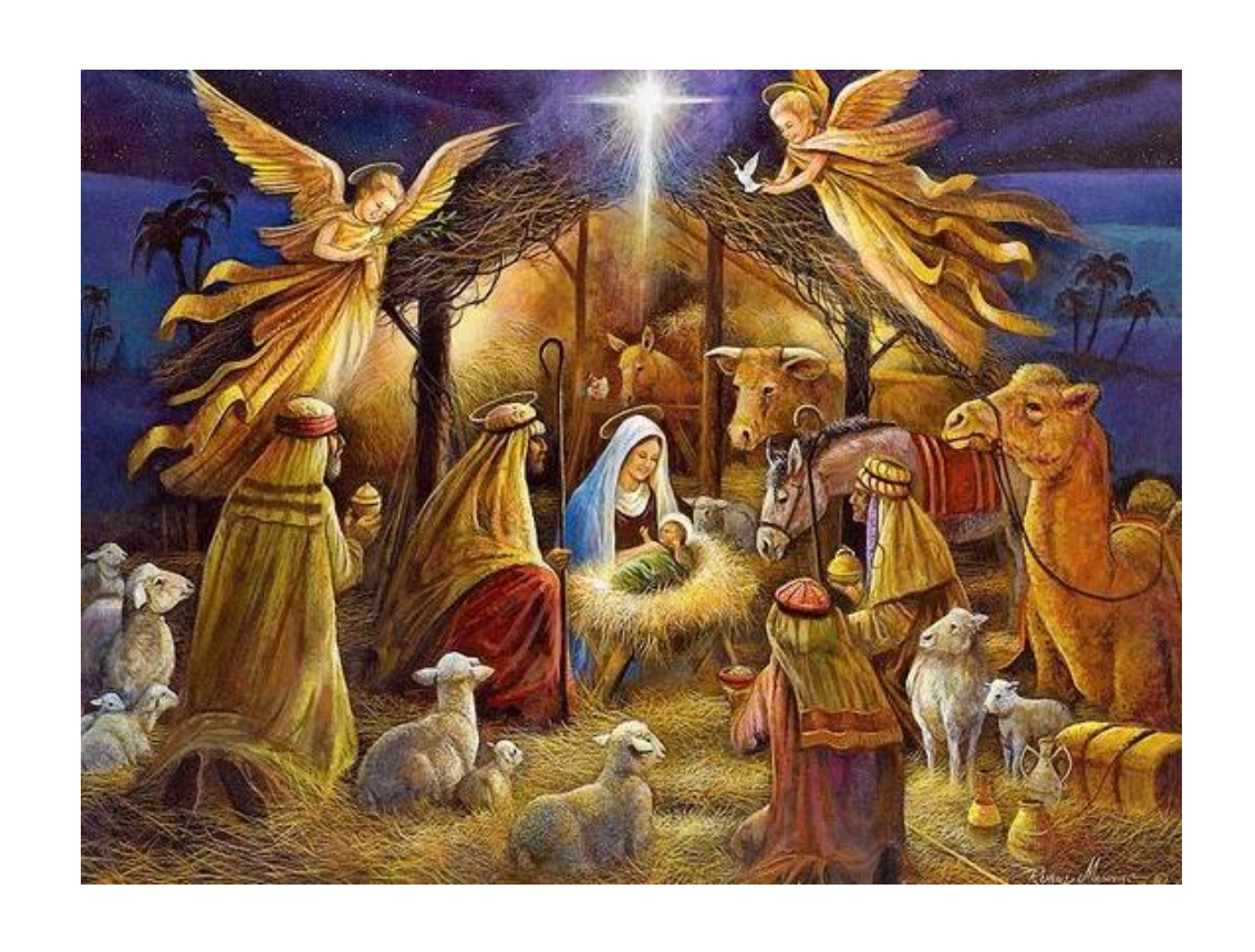
Tuesday 5<sup>th</sup> January 2021 <u>T:</u> Can I create a mind map of the roles of the characters in the Christmas story?